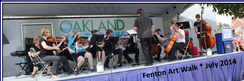
Fenton Art Walk * July 2014

The Orchestra relies on donations and charitable gifts to support its operations. The Fenton Community Orchestra is a Michigan 501c3 nonprofit corporation. Please give Your Community Orchestra a hand by donating. Mail a check or visit the FCO web page and click the DONATE link on the home page. Thank you! Donations are tax deductible.