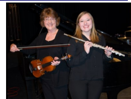
Nothing like family members playing together!