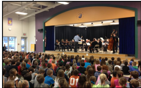
FCO members perform for Tomek Elementary students in December

influx of more musicians, developing partnerships with our schools and area business help strengthen us and prepare for further growth. Dreams of a beginning orchestra and a dedicated General Manager are within reach...with your continued support.