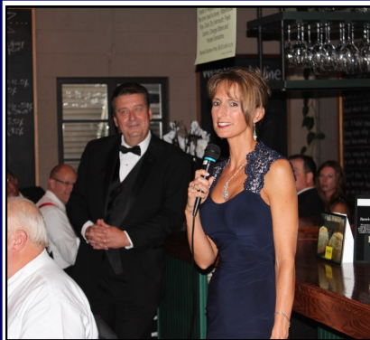
Fenton Education Foundation 10th Annual Black Tie Event September 4, 2014