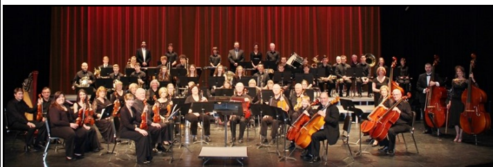
We are grateful to our members of the Fenton Community Orchestra. It is an honor to gather each week with this group!