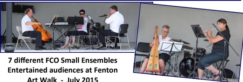
7 different FCO Small Ensembles Entertained audiences at Fenton Art Walk - July 2015

Special Events: Saturday, February 27, 2016 & June 3, 2016