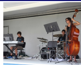
Nothing like family members playing together!

Season 5 Finance Highlights: * 46% Increase in Donations over Season 4 * FCO Received an $8,000 matching grant in January 2015 from Michigan Council for Arts & Cultural Affairs and the National Endowment for the Arts! Please note: We could use supporters who would like to donate to MATCH those funds.