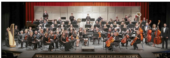
We are grateful to our members of the Fenton Community Orchestra. It is an honor to gather each week with this group!