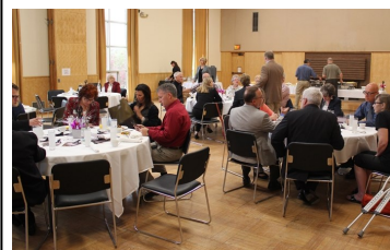
FCO Firebird Breakfast May 2015 On May 5, we celebrated our 5th season sharing our history and potential future with community members and leaders.