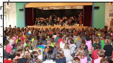
FCO members perform for Tomek, North Road & State Road Elementary students in April 2015

We are beginning Season 6 with a solid foundation and exciting concert plans. An influx of more musicians, and our developing partnerships with schools and area business help strengthen us and prepare for further growth. Dreams of an intermediate string orchestra, a wind symphony and additional concert opportunities for the Fenton area are within reach...with your continued support.